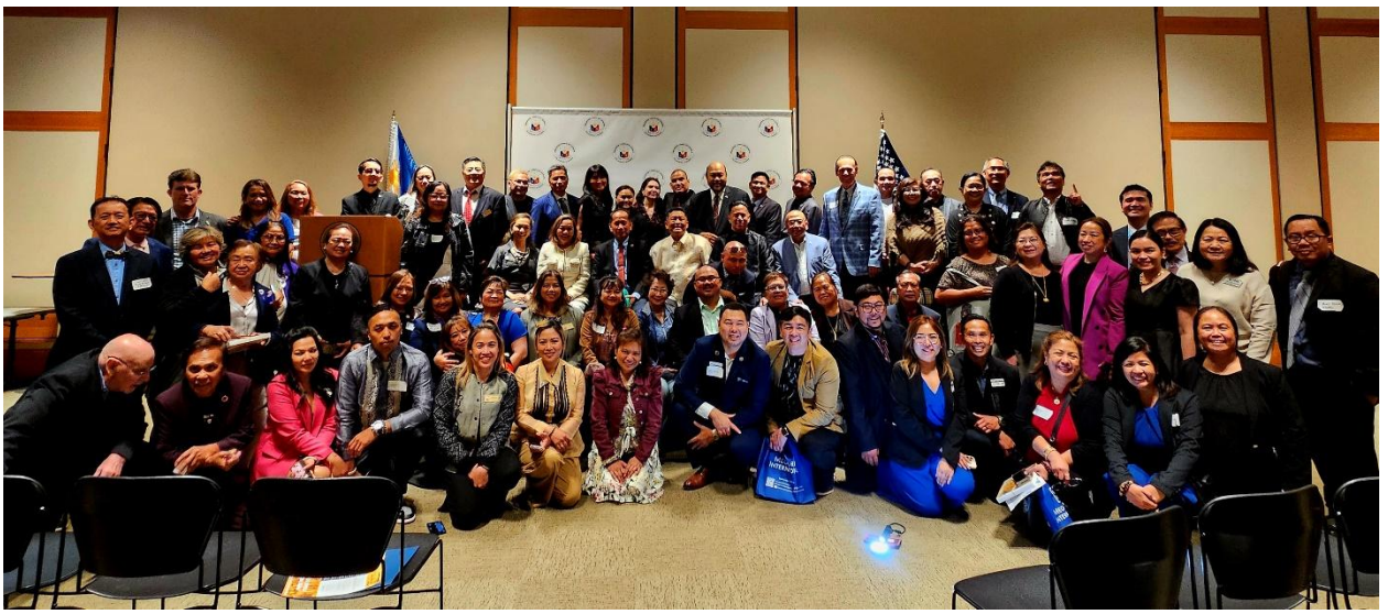
Consul General Badajos with the speakers and participants pose for a group photo