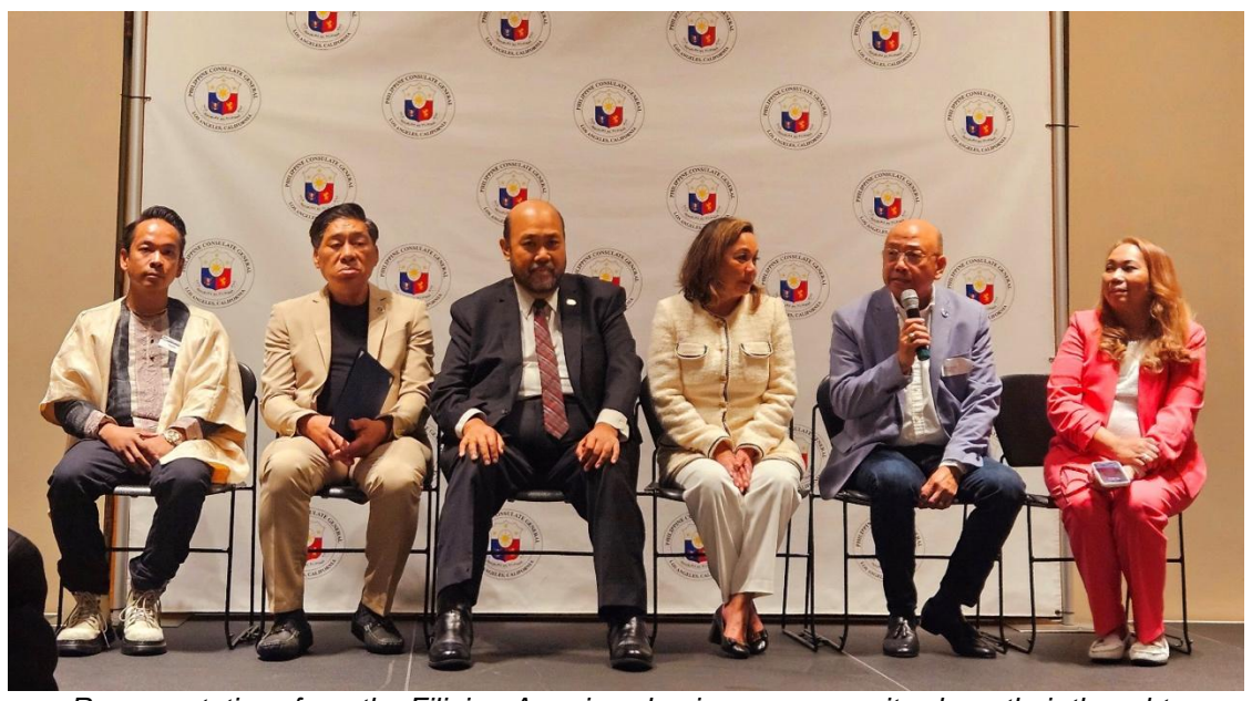
Representatives from the Filipino-American business community share their thoughts during the panel discussion