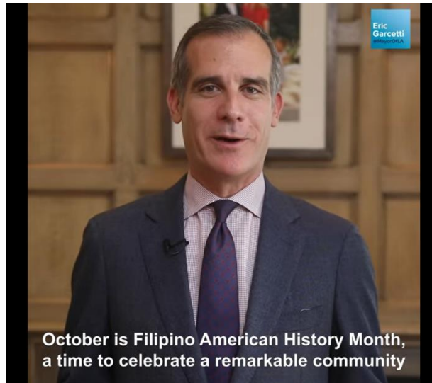
Above: Los Angeles Mayor Eric Garcetti sends his felicitation to the Fil-Am community in a video message posted on his Facebook page on 08 October 2020. Left: A copy of the Proclamation issued by Long Beach Mayor Robert Garcia on 01 October 2020.