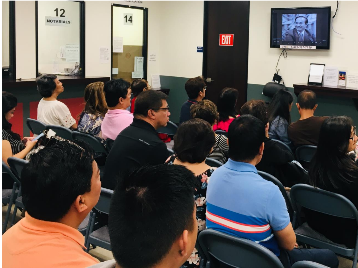
The Consulate General's clients watching the biography of "Mr. Population."

UNFPA was instituted in 1969 and was formerly United Nations Fund for Population Activity. It is the United Nations' main agency for reproductive health and other population-related issues. END.