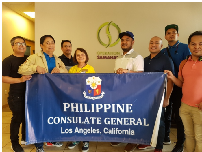
The Mobile Team with a COPAO volunteer

This mission, the 9 th conducted by the Consulate General for 2017, is part of the Philippine Government's efforts to bring its various services closer to its constituents. END.