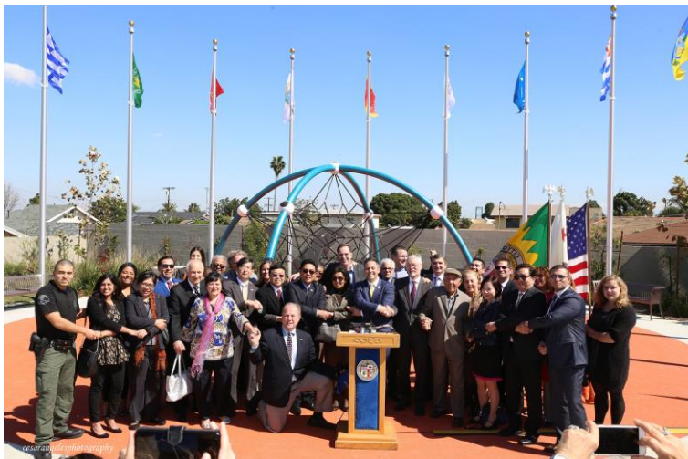
Consul General Adelio Angelito Cruz and Councilmember Joe Buscaino with other dignitaries who graced the Plaza's opening.

The new Los Angeles Sister City Plaza is a 1.68 acre green space, the 38 th park to be opened in the city's 50 Park Initiative, a pledge to bring more open space to park-poor areas of Los Angeles. END.