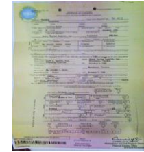
Sample of the NSO/PSA Birth Certificate which you can apply online at www.ecensus.com.ph

The Consular Officer reserves the right to request additional documents from the applicant